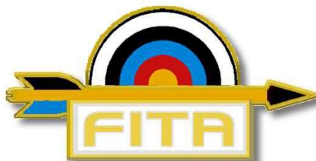
White Arrow Award.

Name and signature of the evaluator: _____